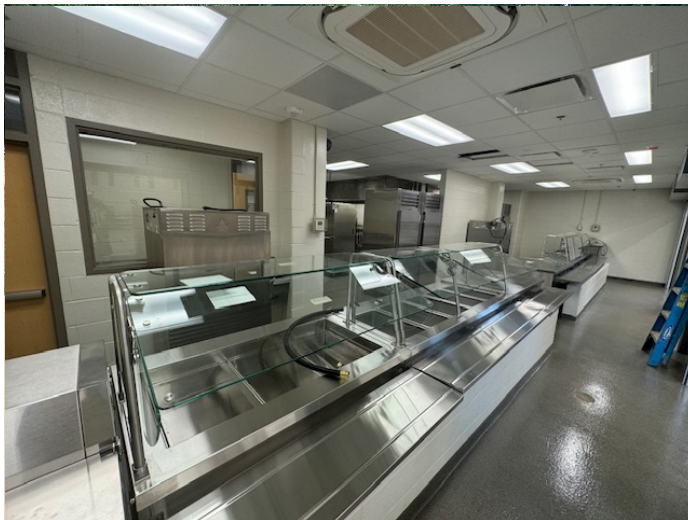
Kitchen serving lines delivered