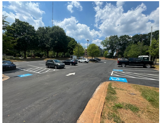
New asphalt paving and striping is complete