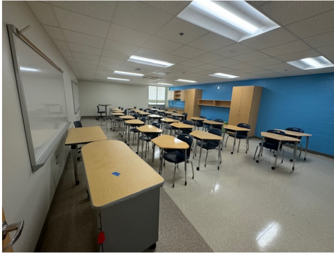
Classroom final clean, new furniture, and casework complete