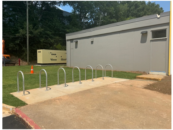
Bike rack installation is complete